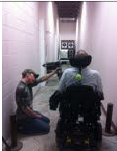
A disabled vet and helper on the crossbow range at West Town during our monthly archery event