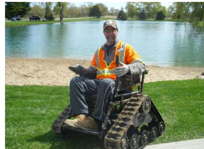
Trackmaster brought out two of their off-road tracked wheelchairs for our members to try out. They have been very supportive of our efforts to show our members the equipment available to get disabled sportsmen back into the outdoors.