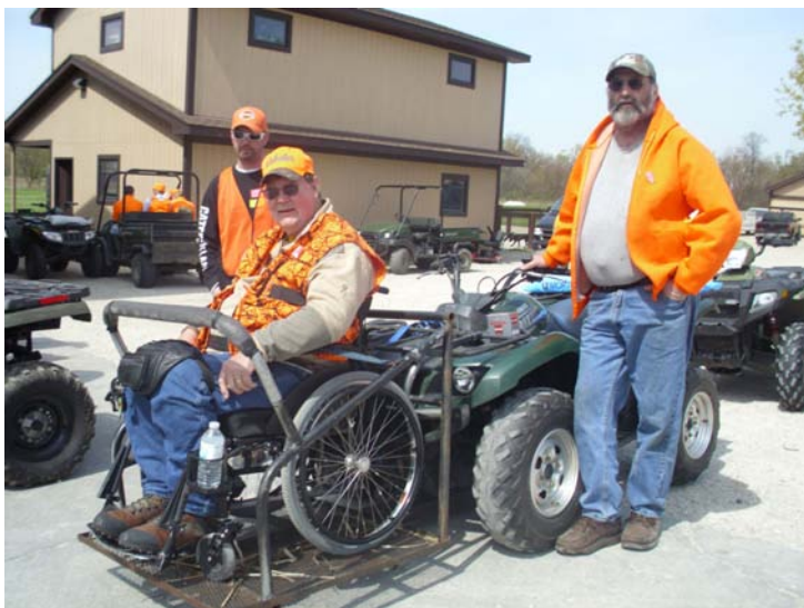
Here is one of the many ways that the volunteers at Halter got our members out in the field to hunt the pheasants. This homemade lift attaches onto the front of an ATV and makes it easy to get around in the tall grass and fields.