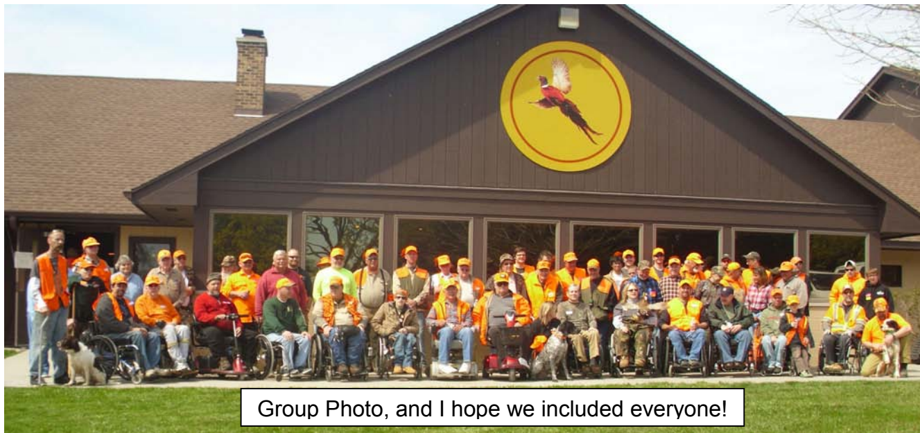
Group Photo, and I hope we included everyone!