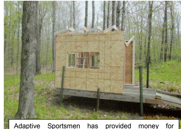
Adaptive Sportsmen has provided money for materials for this new ground blind being set up by Al Lamovec at his property near Willard, Wisconsin. Al has been working hard to set up a disabled youth outdoor camp, called Wisconsin Adventures on Wheels. We are proud to help him provide outdoor opportunities for disabled youths in Wisconsin.